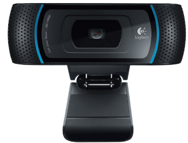
Logitech B910 HD Webcam