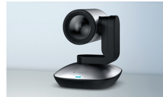
Sitting on table or ledge