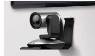
Mounted on wall

For an even easier connection experience, quickly pair NFC-enabled mobile devices to the CC3000e by simply touching them together. And whether the user connects with Bluetooth ® or NFC, the CC3000e is programmed to remember only the last mobile device it was paired to for security and convenience.