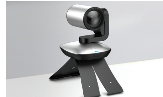
Elevated to eye height