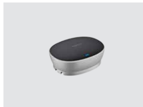
CONNECTIVITY AND USAGE